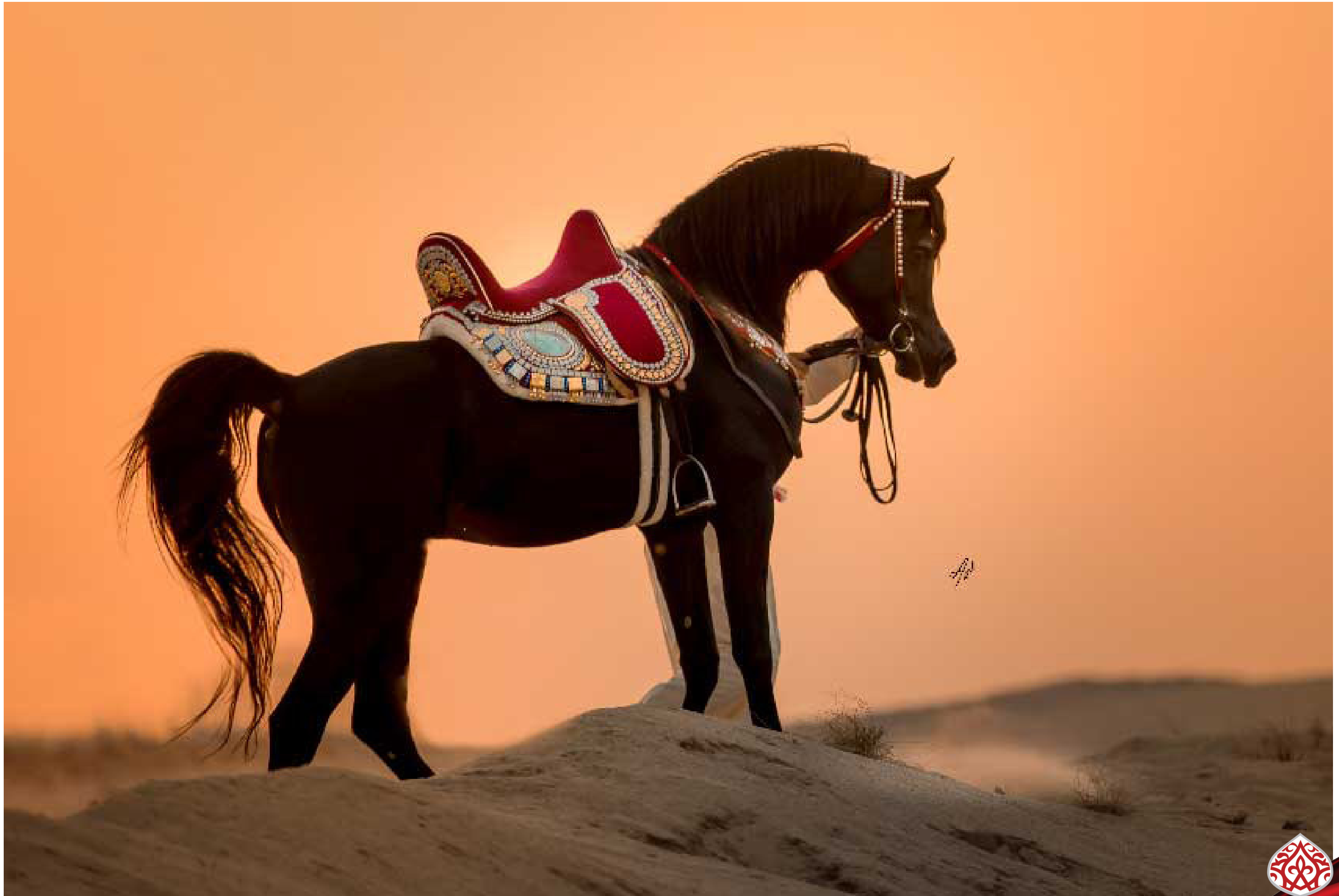
JAKHAL ALFABIA (ZT Marwteyn x ZT Magna Psyche) Black Stallion