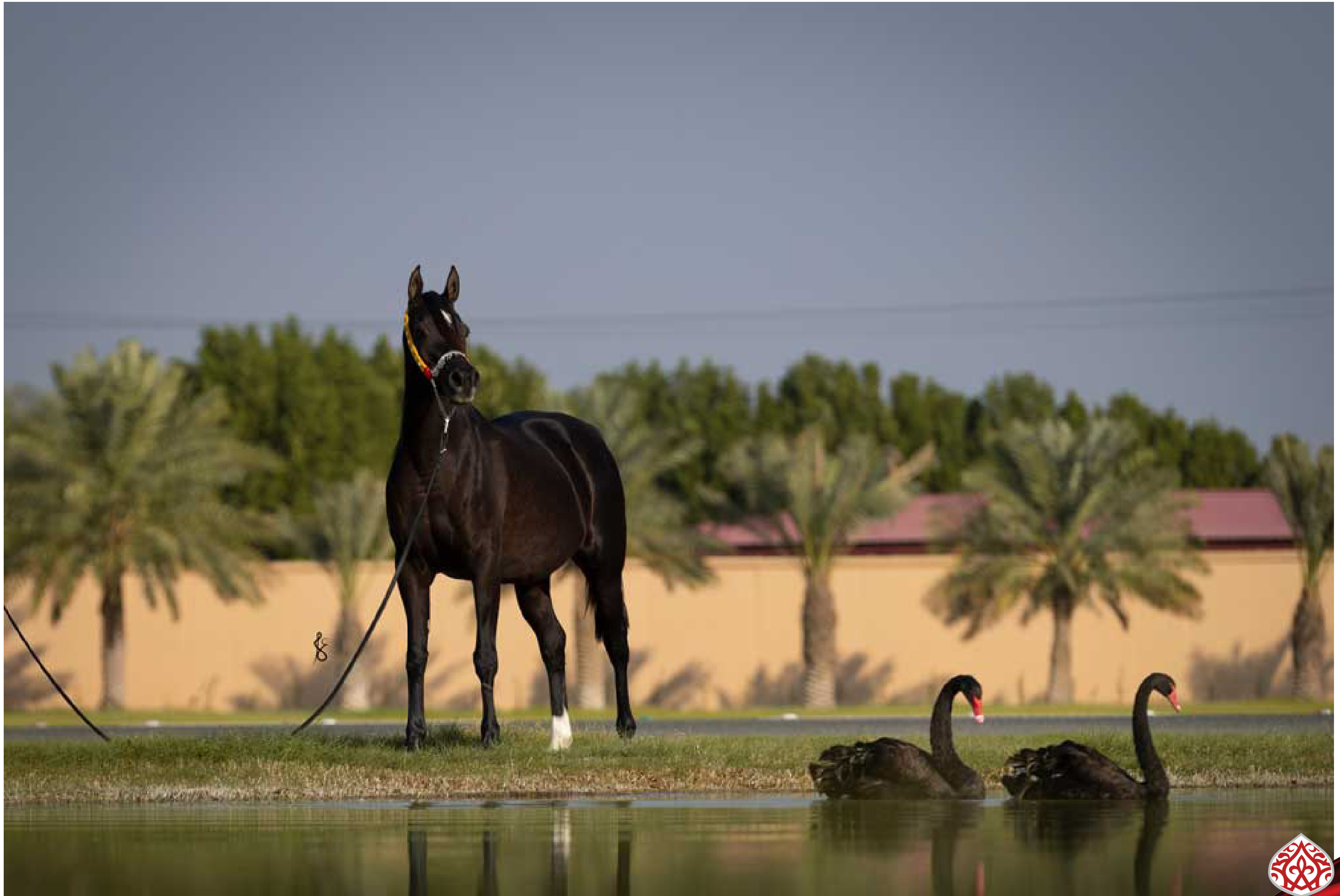
BINT FAITH RCA (Thee Desperado x RSL Faith) Black Mare

Gracing the green pastures of Al Ghanayim Stud, the heavily pregnant daughter of Thee Desperado, Bint Faith on the cover of the Arabian Horse World.