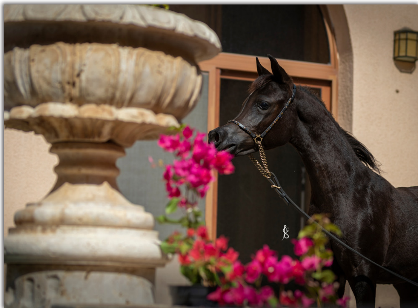
Pre -Championship titles – Ghanayim al Nezar ( SE Colt) pictured as a foal