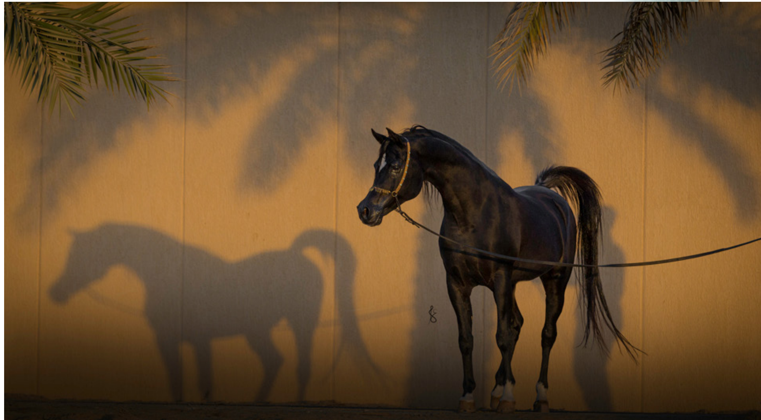
ZAMBUKA (Alixir x Abriel RCA) Black Stallion